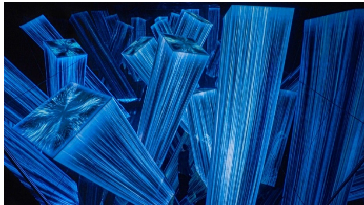
A new symbol of GC's company philosophy SEMUI MEGALITH© by teamLab

The reborn GC Corporate Centre has been renovated and expanded, and includes a fully upgraded showroom, a Dental Information Gallery, and expanded office spaces that foster innovation. The showroom offers hands-on product experiences, simulating real clinical environments. The gallery aims to raise awareness of oral health among the general public and features educational displays on dental care across life stages.