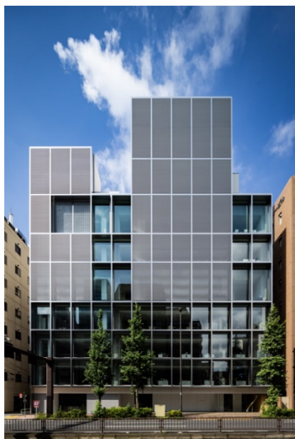
New GC Corporate Center

The new headquarters in Hongo, Bunkyo Ward, completed in 2011, serve as a hub for dental professionals and support the company's mission to lead in dental care innovation. Since then, the center has served as a communication base for disseminating information and has welcomed approximately 300,000 guests –mainly dental professionals– from around the world.