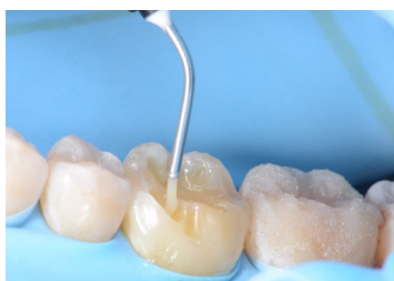
4. Restoring with G-aenial® Universal Injectable