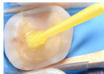
3. Application of G-Premio BOND™ and light cure