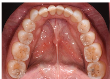
1. Initial presentation, worn dentition

Highly aesthetic restorations can be achieved using a single shade or multi-shade layering technique.