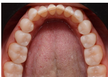
5. Immediately post operative