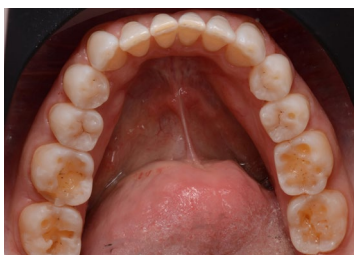
2. After removal of existing restorations