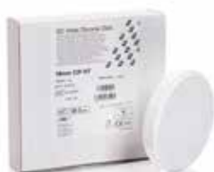
Initial Zirconia Disk