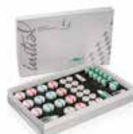
Initial IQ ONE SQIN