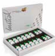
Initial Zirconia Coloring Liquids