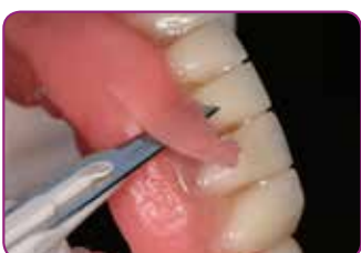
Remove the excesses using a scalpel or scissors. Trim with GC RELINE II POINT FOR TRIMMING.