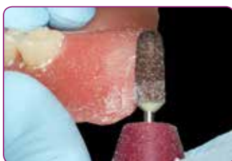
Improved trimming ability for a better finition of margins

Its improved trimming ability makes the ultimate finishing of margins even easier.