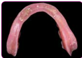
Initial denture, to be relined following the placement of 4 implants.

Straightforward application & handling, throughout the entire procedure