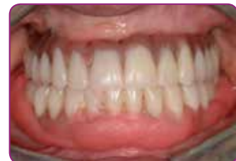
Seat the denture in the mouth and muscle trim. Retain in situ for 5'00".