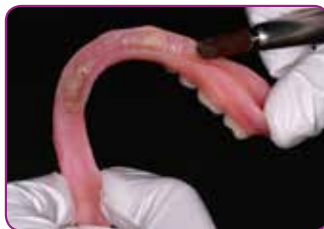
Relieve the area to be relined and roughen the surface.