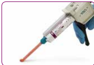
Easy cartridge delivery.