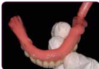
Apply GC RELINE II (Extra) Soft. Working time is 2'00".