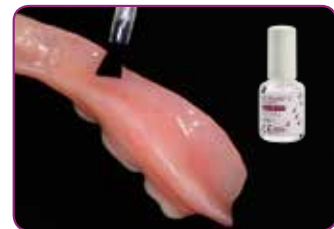
Apply GC RELINE II Primer on the area to be relined. Gently dry with air.