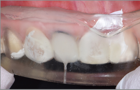
11. The high transparency of EXACLEAR™ allows effective light-curing through the clear stent leading to a higher conversion rate. Light-curing is done and injection moulding completed for the first tooth 12.