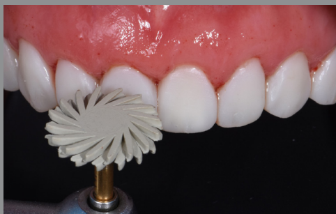
17. Polishing with EVE DiaComp Twist ® pink and grey polisher on a contra-angled slow handpiece.