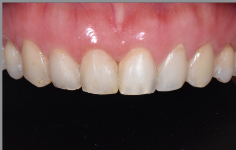
1. Young female patient concerned by failing composite veneers with shade and proportion-mismatch. The patient chose to have composite veneers for teeth 14 to 24.