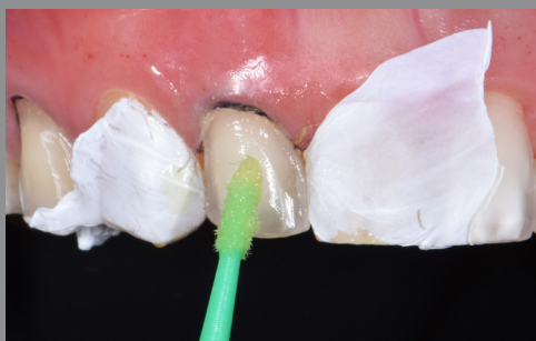
7. G-Premio BOND applied to the etched surface.