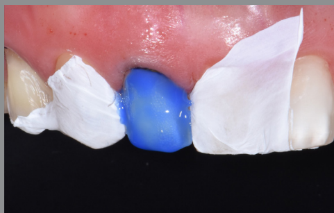
6. Selective enamel etch, one tooth at a time, with isolation using teflon (PTFE) tape to protect the adjacent teeth.