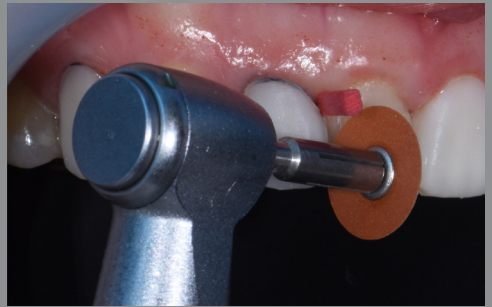
14. Polishing disc with wedging to allow better access beyond the line angles.