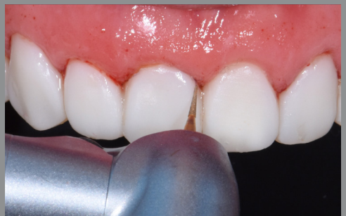
16. Gross removal of excess is carried out, followed by finishing and polishing for all the teeth involved. Cervical finishing is achieved with a high-speed needle-shaped fine tip diamond bur.