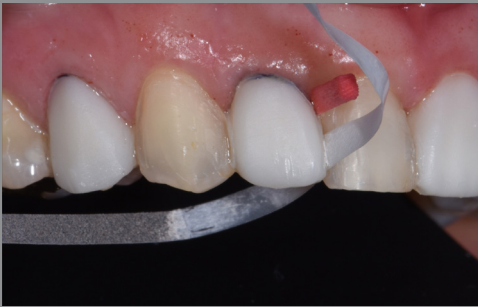
13. Interdigital strip refinement.