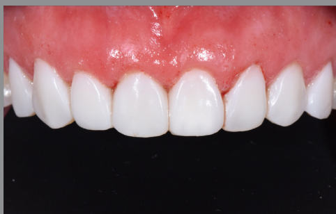
19. Immediate post-operative view, awaiting gingiva rebound and recovery.