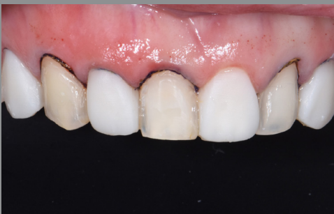
15. Gross finishing completed for the first 4 teeth. The same steps are employed for teeth 13, 11, 22, and 24.