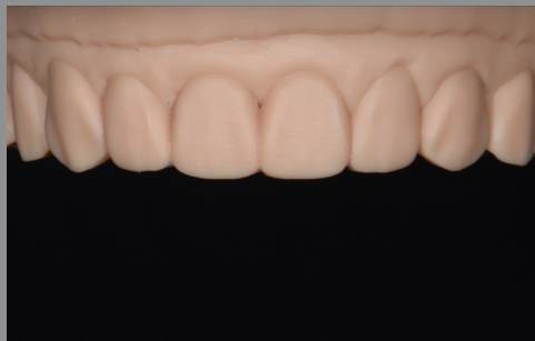
2. 3D printed resin model, from a digital wax-up on 3Shape Dental System*, based on her intraoral scan.