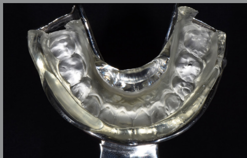
4. Highly accurate information of the digital wax-up recorded in the EXACLEAR™ stent.