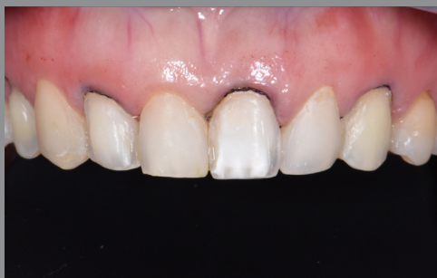
5. Alternate tooth preparation technique employed, involving teeth 14, 12, 21 and 23 initially. Retraction cords placement done.