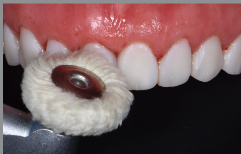
18. Cotton buff on a contra-angled slow handpiece for high shine and lustre.