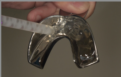
3. EXACLEAR™ clear PVS material syringed onto a non-perforated mandibular tray to capture an accurate impression of the printed resin model.