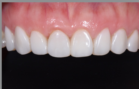
20. 5-week post-operative review with final shape refinement, finishing and polishing. Patient is extremely satisfied with the result.