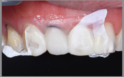
12. EXACLEAR™ stent is removed, to allow removal of gross excess.