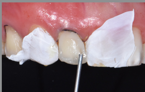
8. Margin of the preparation is wetted with an injectable composite, G-aenial™ Universal Injectable shade BW.