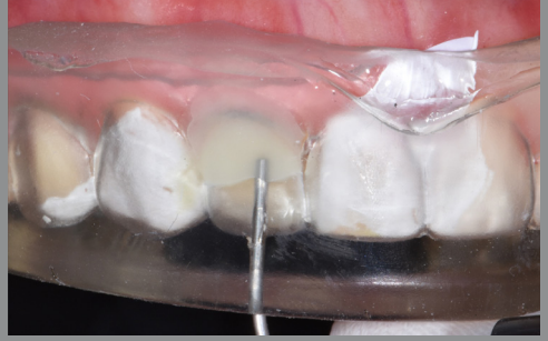
10. Injection moulding with G-ænial™ Universal Injectable BW, beginning with a position close to the margin, before withdrawing incisally through the vent hole.