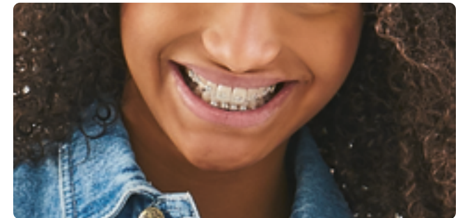
Rh LEGEND mini Rhodium

Depending on the treatment offered, you can choose between a traditional metal bracket, or a more discreet Rhodium metal bracket. Rhodium brackets are highly aesthetic due to their low reflective matte finish. Your Orthodontist will advise you according to your defined treatment plan.